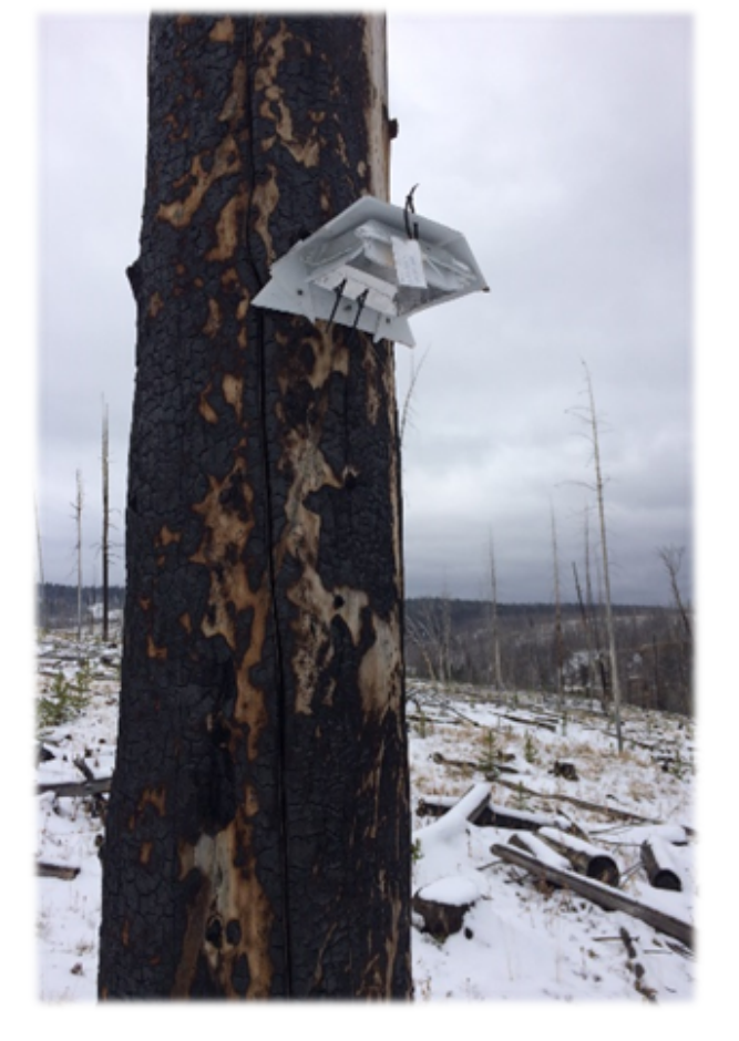
Figure 2. HOBO temperature data logger and housing unit at the Wind River planting unit.

Other explanatory variables of interest from the literature, manager's insights and field visits will be collected from field work in summer 2018. Sites will be sampled by hiking transects (3m apart), and are small enough to enable complete site coverage. Other explanatory data collected include: a 1/100<sup>th</sup> acre survey of nearby vegetation around each WBP in order to investigate potential competitive or mutualistic relationships between species, a general site presence or absence of Clark's Nutcrackers, pocket gophers and domestic cows, hourly temperature data will be collected by on-site HOBO data loggers (Figure 2; deployed to each of the planting units in September 2017 with permission from the associated ranger districts), and estimates of soil texture and rock content will inform an on-site categorical estimate of water holding capacity between 50 and 200mm. Other physical conditions of the sites will be collected from a digital elevation map (DEM; slope, aspect and elevation). In addition, a water balance model developed by one of the authors (D. Thoma) that estimates daily soil moisture, evapotranspiration and water deficit will