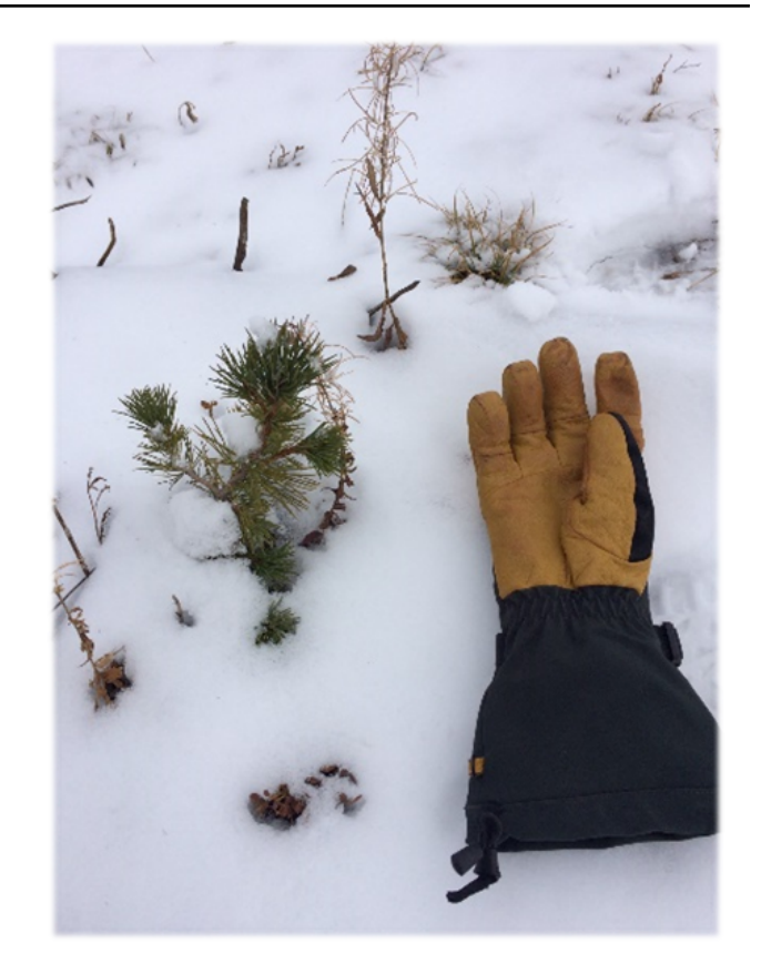
Figure 3. A WBP sapling from the Wind River planting unit.

According to the European Space Agency (ESA), Sentinel-2 is a "land monitoring constellation of two satellites." At our latitude, the mission provides imagery every 3 - 5 days with a visible spectrum resolution of 10m (bands 2, 3 and 4). The second satellite was launched March 7<sup>th</sup>, 2017, and became fully functional in mid-June 2017. Our work will likely be the first to utilize this technology to determine mi-