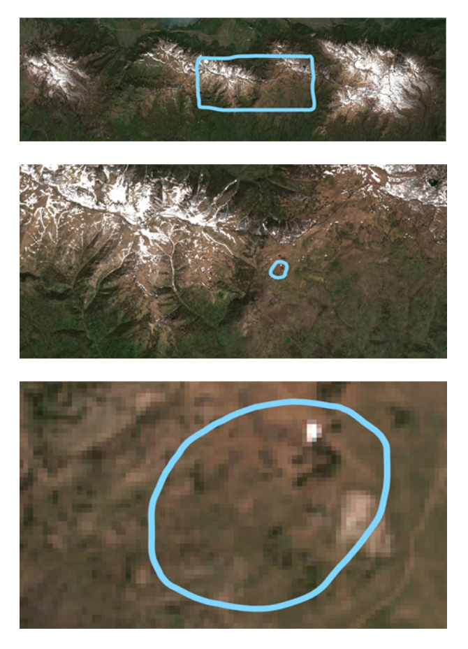
Figure 4. A subset Sentinel-2 image of the Centennial Range from June 2017 with planting unit outlined (top). Additionally subset images of the Centennial planting unit with one planting site outlined (middle and bottom). Snow presence and absence can be clearly seen in the imagery. The unit is approximately 10km, and the site is approximately 500m at its widest.

sis and a final project report will be completed in fall 2018. This project has already cultivated partnerships from multiple entities (NPS, USFS, GYCC and MSU), and represents a unique effort to utilize nascent technological advances for conservation management goals in the GYE. As the project continues to move forward, we will seek opportunities to disseminate our work widely.