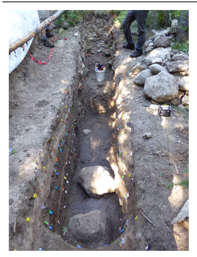
Figure 4. Trench B, which exposed the Teton fault on the lower slope of a 3.5 m high scarp. View is to the east-northeast. South wall (left) exposes well stratified, charcoal-rich sequence of alluvial sediments and paleosols.

units and the timing of past surface-faulting events. Four optically stimulated luminescence (OSL) samples and 17 radiocarbon samples were collected from Trench A, and four OSL and 12 radiocarbon samples were collected from Trench B. The orientation of the trenches and strike and dip of fractures and faults were measured with Brunton pocket transits calibrated to a declination of 11°35' E, and the "right hand rule" was applied to all attitude measurements.