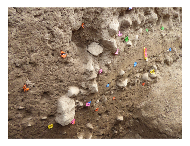
Figure 5. Photograph of a portion of the south trench wall in Trench A. Sloping contact marked by displaced gravel clasts separates well-stratified sediment interpreted as glacial sediment (right) from less-well stratified alluvial sediments and paleosols (left).

As expected, the trenches expose apparent glacial and alluvial sediments. The up-scarp (western) end of Trench A exposed stratified gravel, diamicton, and sand, while the down-scarp (eastern) end exposed stratified alluvial sediments and paleosols.