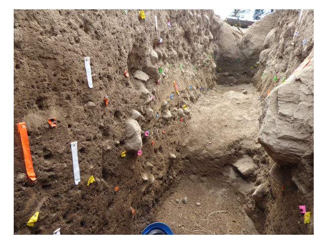
Figure 3. Trench A, which exposed the Teton fault across a low scarp (<1.5 m). View is to the west-southwest.

The site lies within the course of an ephemeral stream draining the incised surface (Figure 2). More specifically, the site lies in the transition between steep, erosional reaches and alluvial reaches, within the transition zone to the alluvial fan that stretches to the eastern shore of Jackson Lake. At the trench site, the east-dipping Teton fault has displaced the surface of a west-sloping alluvial fan, forming an uphill (east-facing) fault scarp. We chose the site because of the