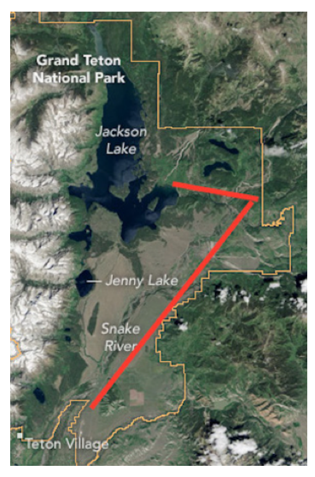
Figure 1. Upper Snake River study area (in red) from Jackson Lake Dam to Moose, WY.

is an increasingly popular site for recreational boating including commercial fishing and scenic float concession operators as well as private boaters, kayakers, and canoeists. It should be noted that while the Snake River south of the town of Jackson is a popular whitewater and scenic float location, this study is focused upstream, on the Snake River as it flows through Grand Teton National Park. This study is also limited, at least for now, to the history of commercial scenic float trip history but does not include fishing trips, canoes, or kayak history.