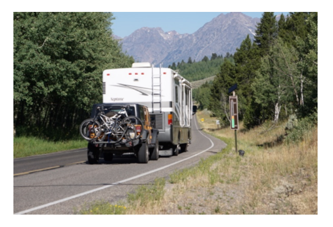
Figure 2. Traffic noise (dB) meter deployed northbound along the John D. Rockefeller Jr. Parkway/US-191/US-287/US-89 traffic corridor.