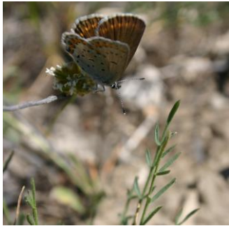
Figure 1. Photograph of a female L. idas butterfly perched above its host plant ( Astragalus miser ) on Blacktail Butte (BTB).

varies among populations and over generations and that this variation is sufficiently large to contribute to the maintenance of genetic variation in L. idas . This report documents the results from the fourth year of this long term study. The first year (2012) was a pilot study in which we collected L. idas for DNA sequencing and tested the distance sampling technique to estimate population sizes (population size is an important parameter for our evolutionary models). In our second year (2013) we collected L. idas and started distance sampling at four populations. In 2014 we collected L. idas and used distance sampling at ten populations. This year, 2015, we visited our ten focal populations for collected L. idas from our ten focal populations to sample individuals for future genetic work. We will estimate population sizes most years, but did not in 2015.