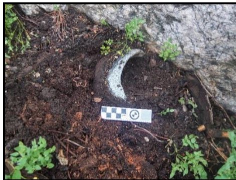
Figure 3. Cached Soapstone Bowl from TE1926.

Site TE 1943 is located just upstream from TE1942 and consists of a small soapstone workshop located above 9,000 feet in a small alpine cirque. The team recorded fragments of four separate soapstone vessels including one with a repair hole (see Adams 2006, 2010), and, a preform of an unfinished soapstone vessel.