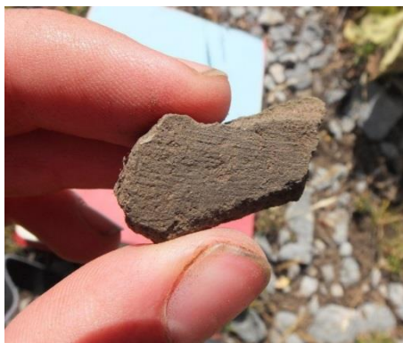
Figure 4. Ceramic Fragment from TE 557/654

In addition to recording new Late-Prehistoric sites, the TAP team reevaluated TE 557 and TE 654 which had previously been recorded by Marceau (1978). Upon examination it was determined that both sites are not unique and are instead part of one large archaeological site located on an alpine shelf near 10,000 feet. Here, the team recorded a dense lithic scatter of obsidian, chert, quartzite, and basalt, and, an obsidian Archaic Pinto Basin style and obsidian Late Prehistoric side-notched projectile point. The team also recorded four pieces of burned non-diagnostic long bone and a ceramic scatter consisting of 18 pieces (representing at least three separate vessels) of Intermountain Style pottery (Finley and Boyle 2014, Mulloy 1958). This marks the first known example of pottery in the high Tetons (Figure 4).