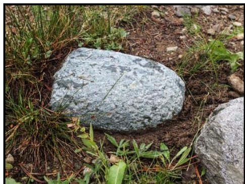
Figure 2. Soapstone Bowl Preform from TE1923.

Site TE1925 is located in an alpine basin just above treeline. This site covers over 500 square meters and consists of a dense lithic scatter of obsidian, chert, Wiggins Fork petrified wood, basalt, and quartzite. Several formal artifacts were recorded at this site including a late-prehistoric obsidian projectile point and pieces of at least three broken soapstone vessels. Additionally, two possible residential structures (a.k.a. lodge pads -- Adams 2010, Stirn 2014b) were recorded at the site.