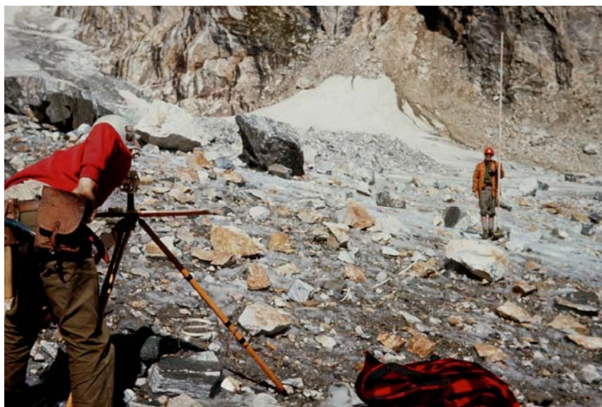
Figure 6. Reed's team surveying Teton Glacier.