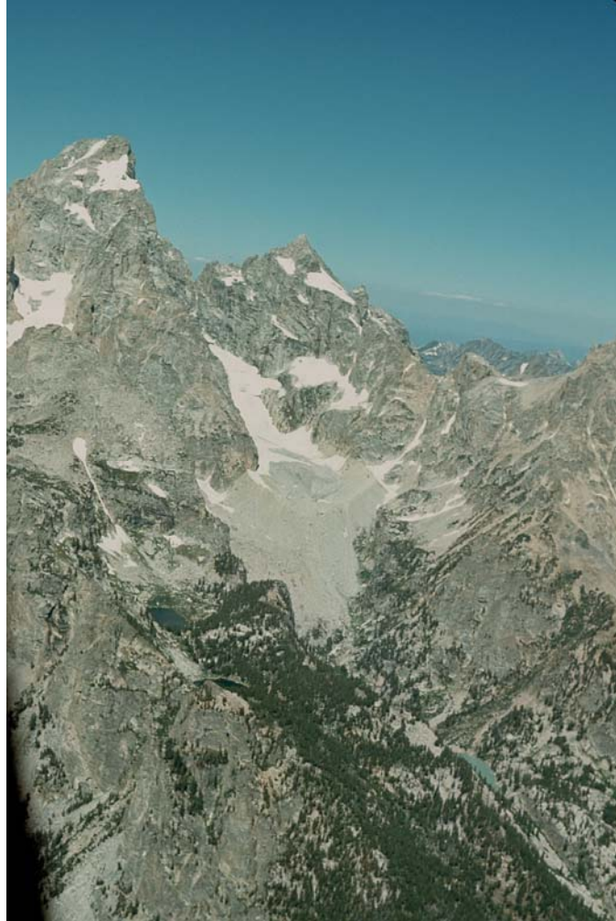
Figure 5. Aerial view of Teton Glacier photographed by Jack Reed in 1964.