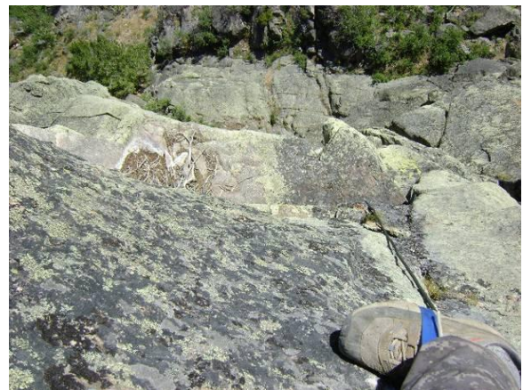
Figure 3. Entry into Peregrine Falcon nest location in Yellowstone National Park

In addition to the nest entries, the historic Peregrine Falcon hack box at Slough Creek (YNP-E-004) was found to be dilapidated, and was removed from public view. It was broken down and stored on the nest ledge for eventual removal and potential use as a display in Yellowstone National Park reflecting the history of the role of the National Park Service in Peregrine Falcon population resurgence and recovery.