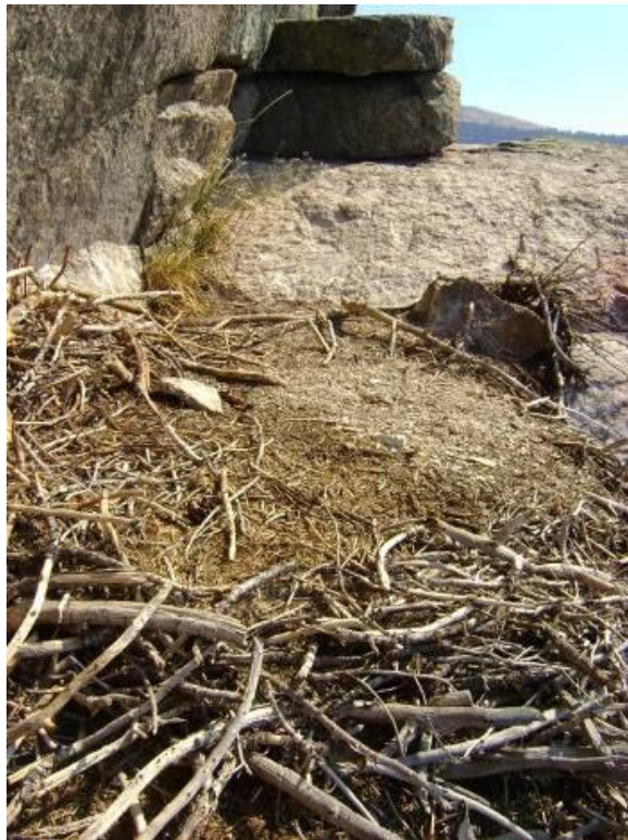
Figure 4. Peregrine Falcon nest ledge on historic Golden Eagle nest in, Yellowstone National Park

Standard nest entry procedures were used to obtain samples (Pagel and Thorstrom 2007) and provide safe climbing conditions (Figure 2, 3, 4). Nests were accessed using modified rock climbing techniques. Eggshell fragments and/or egg remnants of at least 10 fragments per nest ledge were collected using forceps and I-Chem® collecting jars; all samples were measured using a digital gauge (no tapping), and were contrasted to the mechanical gauge technique (Figure 5, 6). No added eggs were collected. Prey remains were placed into a sampling bag; not all feathers were removed from the ledge, but were sampled to obtain overall diversity of the prey from that site. All samples were curated at the Western Foundation of Vertebrate Zoology. Standard ledge measurements were recorded, and digital photographs were taken at each nest ledge.