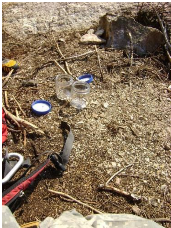
Figure 6. Eggshell fragment and prey remains collection; Peregrine Falcon nest ledge in Yellowstone National Park

The broad range of prey selected by Peregrine Falcons was reflected via samples collected from within six nest ledges (Appendix, Table 3). To date, at least 32 different species were used by Peregrine Falcons during the nest season. One site (YNP-E-004) was entered after the prey samples from other sites had been analyzed; they were curated for future analysis. Peregrine Falcon prey species ranged in size from small Pine Siskins, up to larger species such as Northern Pintail, Franklin's Gull and Pine Marten. The recovery of a Pine Marten tibia at YNP-E-001 was, to our knowledge, the first ever recorded consumption by Peregrine Falcons of this somewhat arboreal mammal. One avian predator, a male American Kestrel, was found in the prey sample at a nest in another location (YNP-E-030). American Kestrels have been found before in prey remain samples in the United States Pacific Northwest (Pagel notes). The most common prey species were Franklin's Gull and American Robin (5 nest sites each). The most unusual prey species were the Franklin's Gull, an uncommon YNP species, and the Pine Marten.