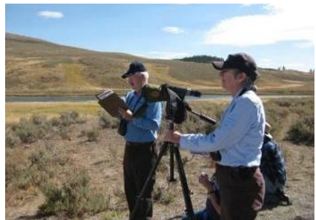
Figure 1b. Hayden Valley Raptor Observation day in Yellowstone National Park.