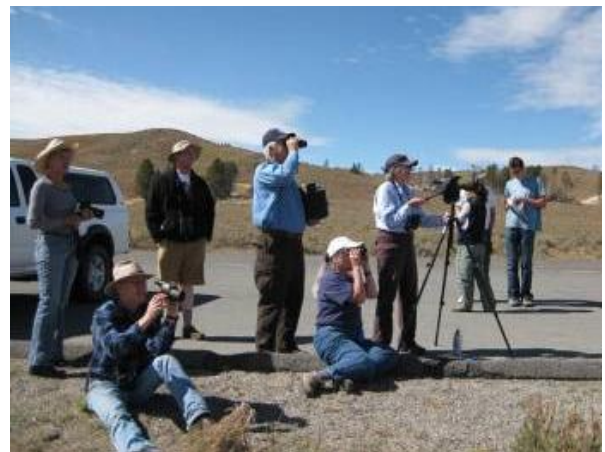
Figure 1a. Hayden Valley raptor observation day in Yellowstone National Park

There were several ranger-led programs on raptors ecology and identification during summer and fall. Duffy led a pilot public hawkwatch in Hayden Valley during fall migration during which 160 visitors, local residents and staff observed migrating raptors in Hayden Valley (Figure 1 a, b) All visitors at this event observed raptors (mostly Swainsons Hawks) migrating through Hayden Valley.