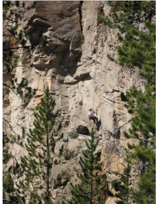
Figure 2. Entry into peregrine falcon nest ledge in Yellowstone National Park

Nest entries occurred in early August 2010, with additional entries occurring in mid September 2010. Two nest ledges were entered during both time periods; either to collect additional data or because the initial attempt was thwarted by lack of a static line of sufficient length. All nest ledges targeted for this project were entered.