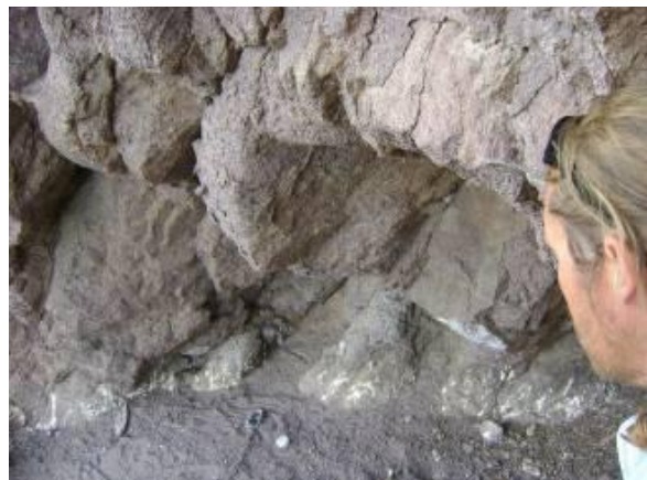
Figure 5. View into Peregrine Falcon nest ledge in Yellowstone National Park