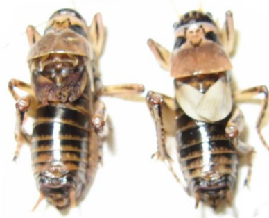
Figure 1. The hindwings of non-virgin males (left) are damaged by females during mating. Virgin males (right) have pearly-white, undamaged hindwings. Note: the forewings were removed.

The sagebrush cricket, Cyphoderris strepitans , occurs in high-altitude sagebrush meadows and is one of seven known surviving species in the once highly diverse family Haglidae (Morris and Gwynne 1978, Kumala et al. 2005). Males emerge from their burrows at sunset and ascend the sagebrush where they sing late into the night, which functions as their primary means of attracting a female (Snedden & Sakaluk 1992, Snedden & Irazuzta 1994). Copulation is initiated when a female climbs onto the dorsum of a male. While the male attempts to transfer a spermatophore, the female feeds on the male's fleshy hind wings. This mating behavior makes the sagebrush cricket an ideal system for studies of sexual selection because it allows the mating status of males to be readily determined in the field by simply examining their hind wings for damage. Virgin males have pearly-white hind wings, while the hind wings of non-virgins are visibly wounded with melanized scars (Figure 1).