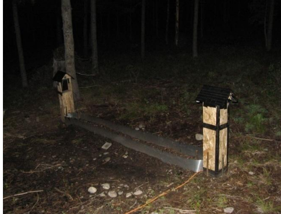
Figure 3. Females were placed in the middle of the choice trial arenas and the manipulated & control signals were randomly assigned to the left or right speaker.

The attractiveness of sagebrush cricket song was assessed by synthesizing artificial songs and conducting an arena playback experiment. Four arenas were setup at a field site neighboring the UW-NPS research station. The UW-NPS research station has no nearby populations of sagebrush crickets, which gave us an acoustically controlled field environment for conducting audio playback choice trials. Aluminum flashing was placed around the arena perimeters (2.0 x 0.3 x 0.1 m) to contain the females. Speakers were positioned at the terminals of the arena at a height within the natural perching range of males singing in sagebrush meadows (Figure 3).