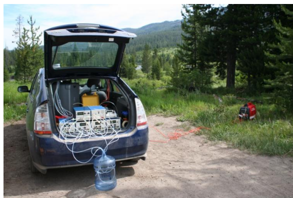
Figure 1. Field setup of the portable metabolic chamber. The metabolic chamber is powered through a portable generator (right) and all metabolic equipment is contained within the vehicle.

Traps containing pikas will be placed into a cloth bag for immediate transport to the on-site metabolic chamber. Pikas will be transferred to an anesthesia jar, which consists of a see-through plastic jar with airholes perforating the bottom to prevent the build-up of carbon dioxide. A small perforated container (film canister) containing cotton soaked with a liquid anesthesia (isoflurane) will be placed in the larger anesthesia chamber with the pika. Following anesthetization pikas will be removed from the chamber, weighted, sexed, given eartags, and placed into the metabolic chamber.