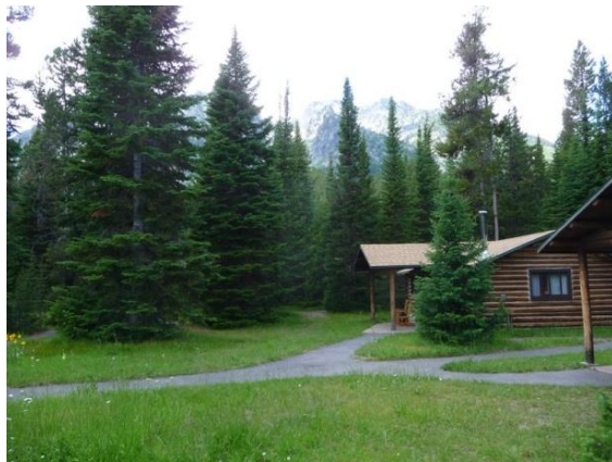
Figure 2. Cabins and landscaping, with Tetons in background (Mary Humstone, 2009).

Jenny Lake Lodge has outlasted other historic dude ranches in the Park, such as the White Grass Ranch and the Bar BC, and has operated longer than the other lodges, such as Jackson Lake Lodge, Colter Bay Cabins and Signal Mountain Lodge. The property represents a long history of tourism in the area, and reflects the changes in the tourism industry over the past 80+ years. Jenny Lake Lodge also represents the history of Grand Teton National Park, since it was one of the properties purchased by J.D. Rockefeller's Snake River Land Company for inclusion in the Park, and has been at the center of many debates over what visitor amenities the Park should offer.