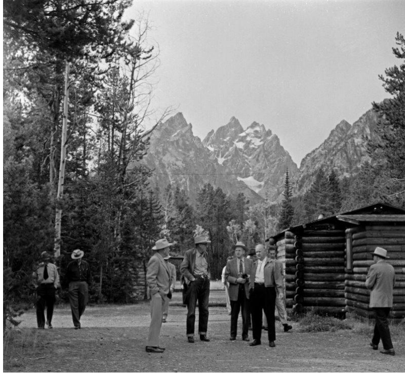
Figure 7. Meeting of the National Park Service Advisory Board, Jenny Lake Lodge, 1956