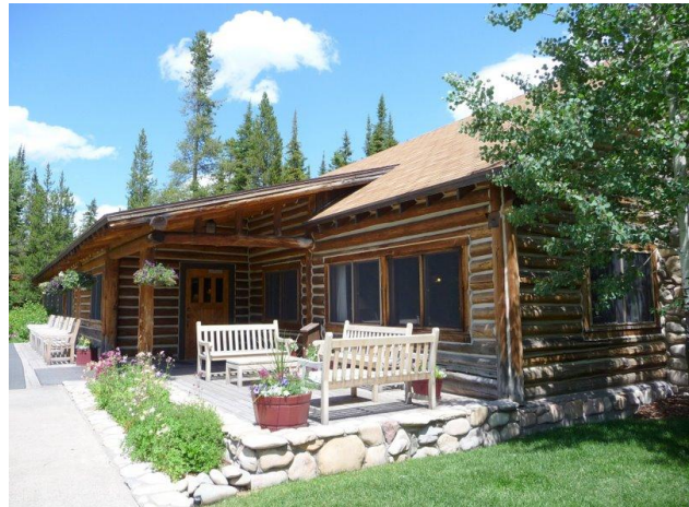
Figure 3. Main lodge at Jenny Lake Lodge (Mary Humstone, 2009)

the 47 buildings on the property date from the period of significance (1922-1957), and all represent the same tradition of log construction with rectangular floor plans, low- to medium-pitched purlin roofs, open porches and simple interiors with exposed log walls. Newer guest cabins were built to mimic the old, resulting in a collection of buildings that are similar and yet not identical.