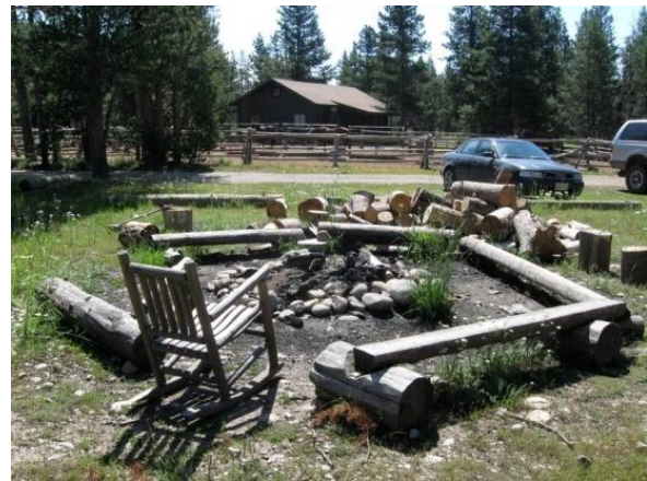
Figure 10. Fire pit in the “Employee Area,” with corrals and stable house in the background (Hilery Walker, 2009)

horseshoe pit, and fire pit (Figure 10). The employee buildings range in size from singles to triplexes and dormitories, and like the guest buildings they are log buildings, most with purlin roofs. More so than the guest area, the employee area represents the common Western tradition of moving buildings from other properties. This practice was especially common during the Snake River Land Company's period of ownership (1927 to 1950), since the land-acquisition company often dismantled the homesteads, ranches and tourist facilities it purchased. The employee area lacks the trees and other natural vegetation found in the guest area, and cabins appear to be arranged in a random pattern.