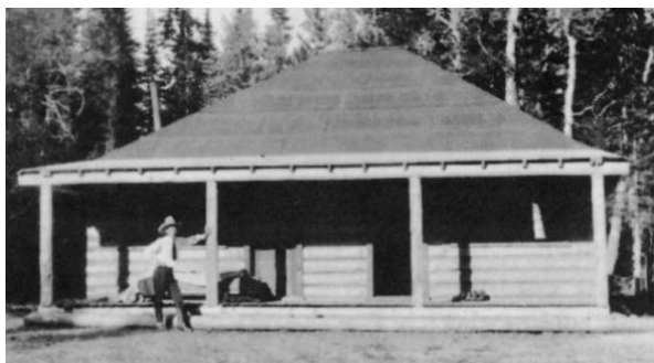
Figure 4. Original Main Lodge, c. 1928 – now the dining room.