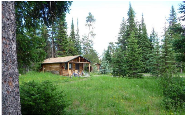
Figure 9. Single cabin exhibiting the “Dude Ranch Rustic” style, set in a natural landscape (Mary Humstone, 2009)

In his design Spencer did not stray far from the “Dude Ranch Rustic” architectural tradition (Figure 9). The 1950s were a time when Rocky Mountain Rustic Architecture was embraced as a viable style in which trained architects designed: “formal Rustic architecture represented the deliberate attempt -usually an architect's deliberate attempt -- to convey historical images and to meld man-made resources with their wilderness environment” (Caywood and Hubber 1997). Aside from the kitchen addition, the only concessions to modern architecture were the asymmetrically angled concrete aprons outside the cabins, most of which were squared off in later renovations.