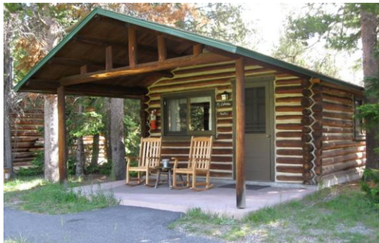
Figure 6. Columbine, a gable-front single cabin built by the Grand Teton Lodge Company in 1937 (Hilery Walker 2009)

Teton Lodge Company (GTLC). The Danny Ranch was renamed Jenny Lake Ranch, and the GTLC constructed several more guest cabins, four of which exist today. These cabins matched the existing cabins in form, materials and workmanship. Two of the 1937 cabins are gable-front single cabins (Figure 6) while the other two are larger cabins with eave-front gable roofs similar to Grace's original cabins. The new cabins were plumbed and equipped with private baths, and hot and cold running water was added to the existing cabins. At this time, a dining room and kitchen were added to the south end of the main lodge, replacing Grace's 1928 addition.