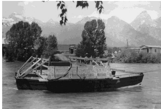
Figure 8. Menor's Ferry at the Snake River crossing (photo by Harrison R. Crandall, photo courtesy of Grand Teton National Park Archives).

Menor's Ferry at the Snake River crossing is a classic Crandall photograph—Hank framed the famous ferry with the Tetons (Figure 8). Menor's Ferry once belonged to William D. Menor who came to Jackson Hole in 1894, taking up a homestead beside the Snake River, and constructing a ferryboat that became a vital crossing for the early settlers of Jackson Hole (NPS 2007).