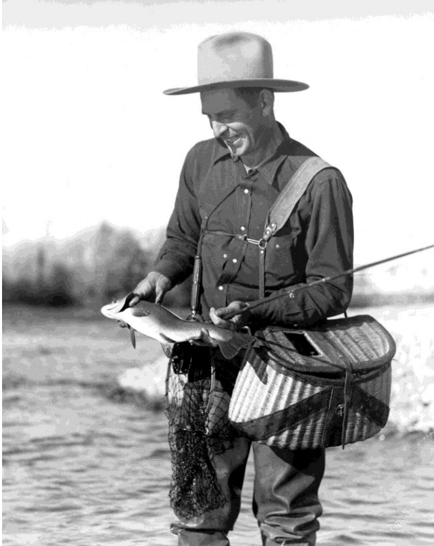
Figure 15. A Nice One from the Snake River (ca. 1944) (photo by Harrison R. Crandall, photo courtesy of Grand Teton National Park Archives).