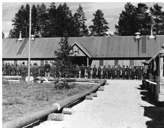
Figure 6. Dedication ceremony of the Jenny Lake Civilian Conservation Corps (CCC) Camp on July 28, 1935.

The Civilian Conservation Corps (CCC) was a public work program created for the unemployed by President Franklin D. Roosevelt during the Great Depression. The CCC operated from 1933 until 1942. The CCC made important conservation and natural resource improvements to the federal lands, including the national parks. As early as 1933, Horace M. Albright, the Director of the National Park Service, envisioned the CCC working in the Grand Teton National Park in order to remove thousands of dead trees that lined the banks of Jackson Lake (NPS 2000). The trees were drowned by an engineered increase in the Lake level. When the CCC came to the Grand Tetons in 1935, Hank was there to document the dedication ceremony at the Jenny Lake CCC Camp (Figure 6). The Park's digital photo archive includes other photos of CCC work projects. For example, the CCC men of the Jackson Lake crew were housed in large tents (Figure 7).