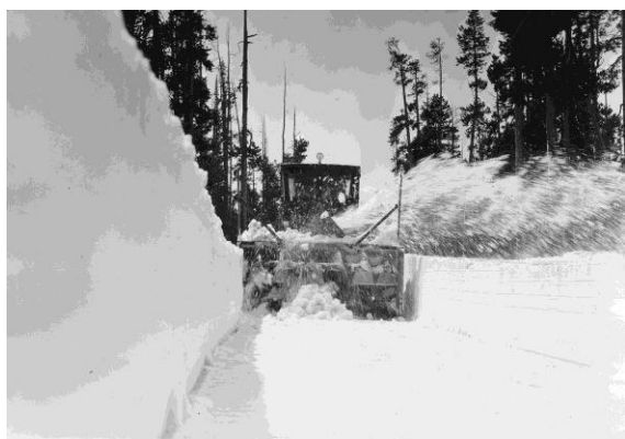
Figure 5. Rotary snow blower at work.