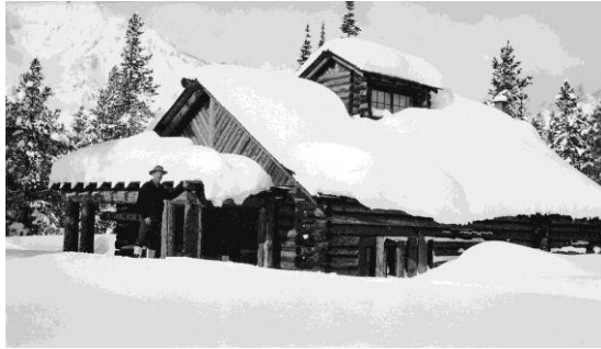
Figure 9. Harrison R. Crandall Studio (at the Crandall homestead location) with Hank Crandall standing next to the porch.

The Crandall Studio building was constructed on the family homestead in 1925-26, and opened for business in 1927 (Barrick 2008). Hank designed his studio to withstand a heavy snow load, and, as Figure 9 suggests, the building was adequately tested. The studio building was moved to the Jenny Lake area, where it now serves as a National Park visitor center.