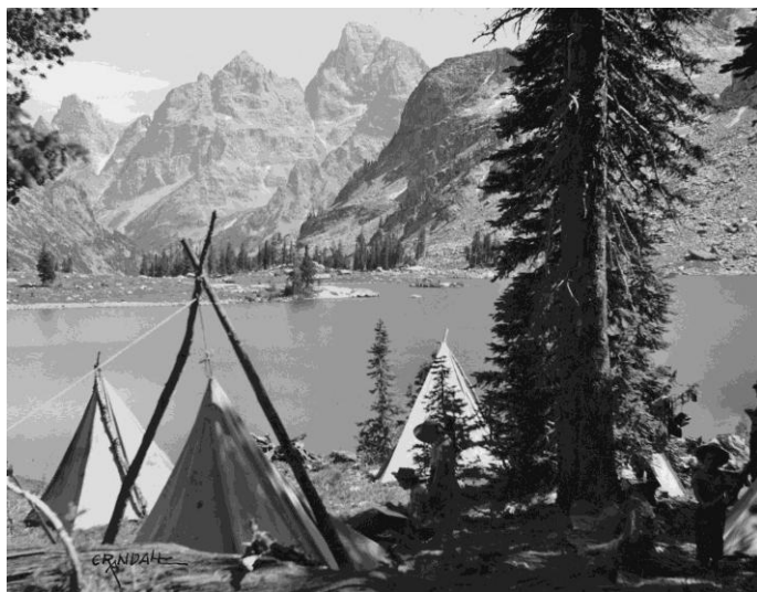
Figure 13. Camping on Lake Solitude.

Hank packed his photographic equipment up steep trails in order to capture the beauty of the Grand Teton high country. The image entitled “Camping on Lake Solitude” captured the tranquility to be found in the Teton wilderness (Figure 13). Hank added drama to his compositions by using the full range of black and white contrast. The mountain landscape is framed by the towering “black” silhouetted tree and the “whites” of the sunlit tents. The overall effect, with both natural and human elements, seems to suggest that the temporary presence of campers is a welcomed activity in the Teton wilderness. Hank also composed wilderness images without evidence of humans. For example, “Alligator Lake at Alaska Basin” is one of his high country masterpieces (Figure 14).