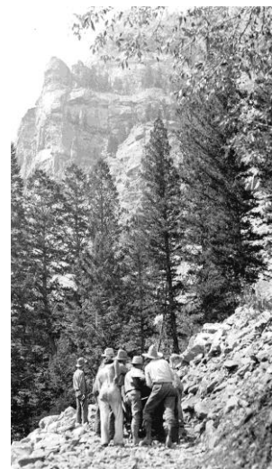
Figure 3. Trail construction workers in Grand Teton National Park.

In the 1930's, the frontcountry of Grand Teton National Park was enhanced with new roads and trails. These facilities insured that millions of Americans could visit the Park, and access the backcountry. Hank no doubt enjoyed his many excursions into his beloved Tetons in order to document the construction or improvement of Grand Teton trails (Figure 3). Hank was also busy photographing work crews as they cut-and-filled, graded, and oiled the Park's roads (Figure 4). Note the combination of motorized (foreground) and horse-drawn (background) equipment in action. Of course, the roads needed to be maintained. The vintage rotary snow blower had its work cut out for it clearing a path through the deep snow (Figure 5).