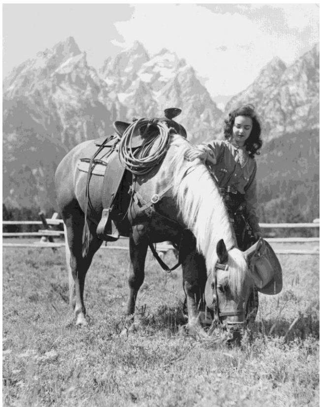
Figure 12. Beauties.

Hank packed his photographic equipment up steep trails in order to capture the beauty of the Grand Teton high country. The image entitled “Camping on Lake Solitude” captured the tranquility to be found in the Teton wilderness (Figure 13). Hank added drama to his compositions by using the full range of black and white contrast. The mountain landscape is framed by the towering “black” silhouetted tree and the “whites” of the sunlit tents. The overall effect, with both natural and human elements, seems to suggest that the temporary presence of campers is a welcomed activity in the Teton wilderness. Hank also composed wilderness images without evidence of humans. For example, “Alligator Lake at Alaska Basin” is one of his high country masterpieces (Figure 14).