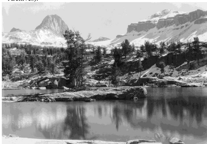
Figure 14. Alligator Lake at Alaska Basin (photo by Harrison R. Crandall, photo courtesy of Grand Teton National Park Archives).

Hank’s photographs captured the many activities that attracted people into the Grand Teton National Park, in part, to promote public recreation. His image “A nice one from the Snake River” illustrates one type of fun—fishing. The image is almost a moral statement about the outdoor benefits that Americans can share in by visiting their national parks (Figure 15).