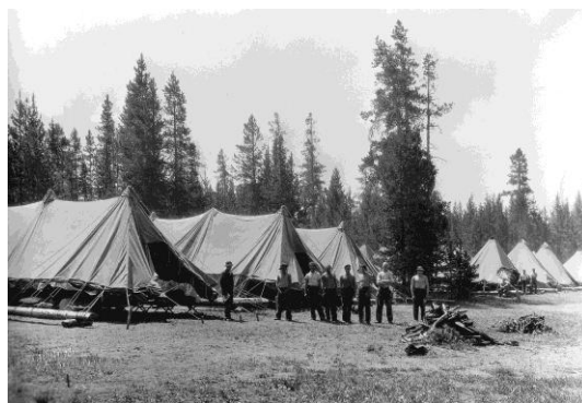
Figure 7. Jackson Lake Civilian Conservation Corps (CCC) Camp.

Menor's Ferry at the Snake River crossing is a classic Crandall photograph—Hank framed the famous ferry with the Tetons (Figure 8). Menor's Ferry once belonged to William D. Menor who came to Jackson Hole in 1894, taking up a homestead beside the Snake River, and constructing a ferryboat that became a vital crossing for the early settlers of Jackson Hole (NPS 2007).