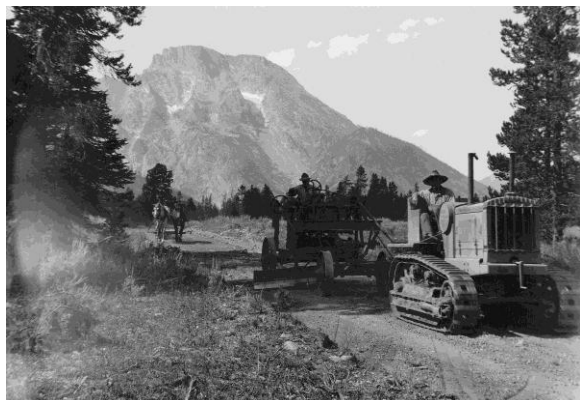
Figure 4. Road grading in Grand Teton National Park near Mt. Moran.