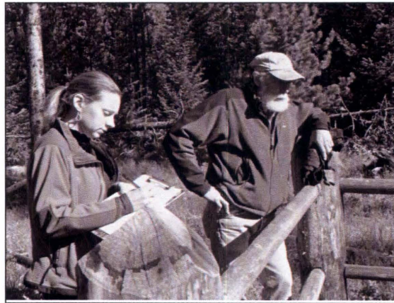
Figure 9. Visitors at John Sargent's grave.