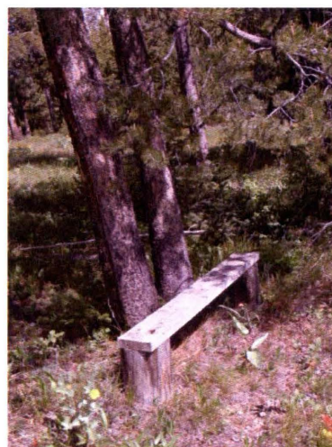
Figure 6. The resting bench built by Slim Lawrence for Verba's walks along the lake shore.