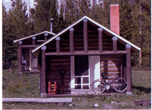
Figure 8. The Shop Cabin and Twin Room Cabin viewed from the west.