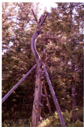
Figure 1. The violin tree located on Sargents peninsula.