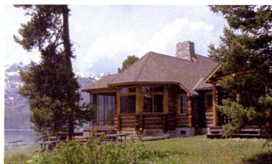
Figure 2. The Berol lodge viewed from the south.