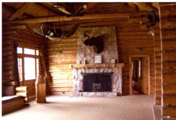
Figure 5. The living room of the Berol lodge.