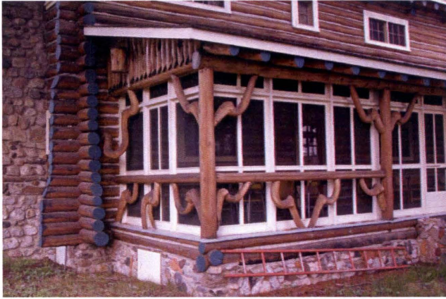
Figure 7. Johnson (Mae-Lou) lodge porch showing detail of log detailing.