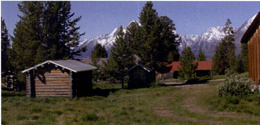
Figure 10. Tack Cabin and Smokehouse on the left, pole barn on the right, wood shed in the far central viewed from the east.