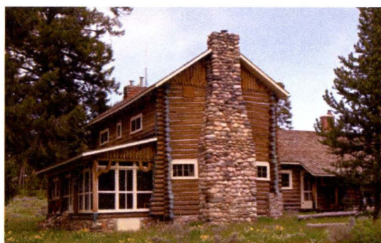
Figure 4. The Johnson (Mae-Lou) Lodge viewed from the south with detail of stone fireplace