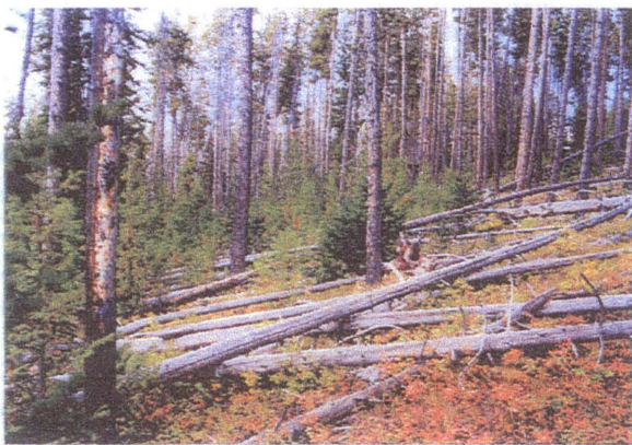
Figure 2. Photograph of the project areas. View north in the northern portion of the project area.