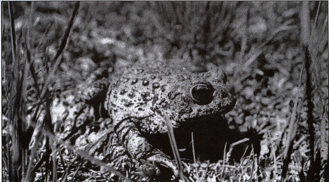
2. Western toad ( Bufo boreas ).