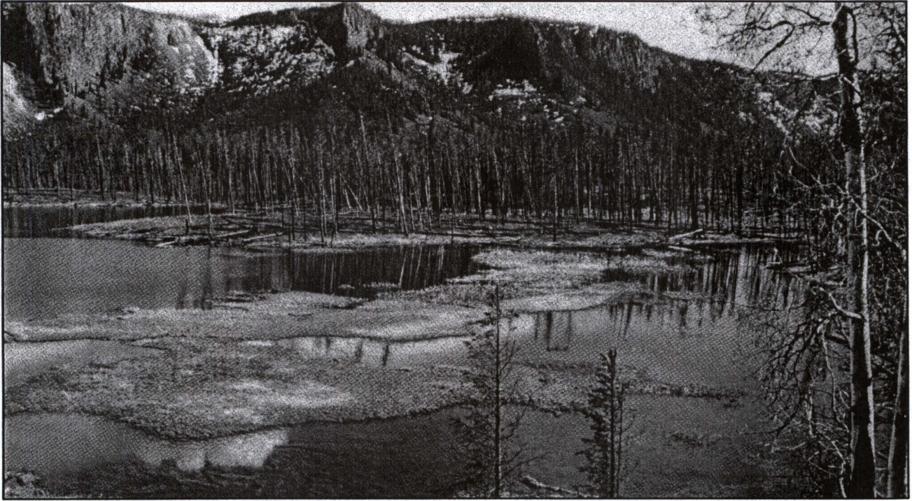
1. Harlequin Lake.